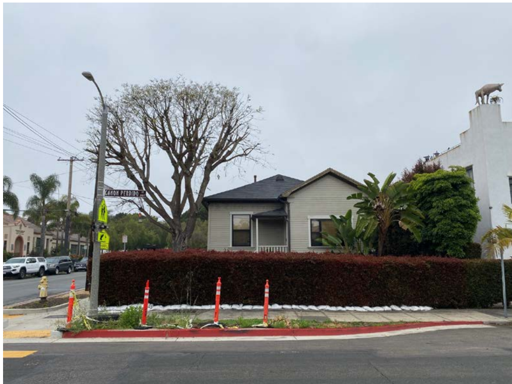
Front Yard 902 N. Nopal Street – Victor Beltran 5-22-24