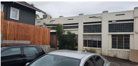
900 PHILINDA - NORTHWEST ELEVATION