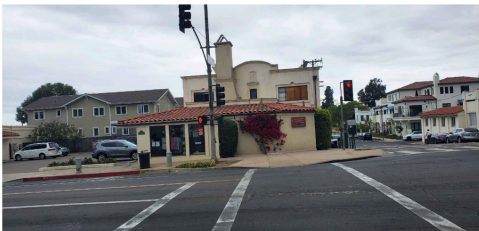
NORTH MILPAS - LOOKING SOUTHEAST