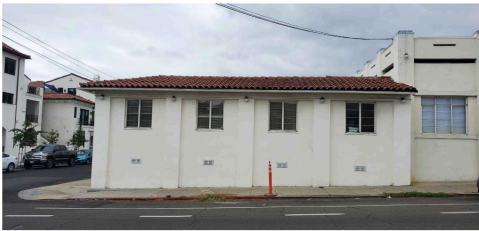
CANON PERDIDO - LOOKING NORTHWEST