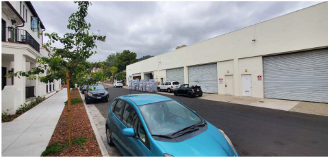
PHILINDA AVENUE - LOOKING NORTHEAST