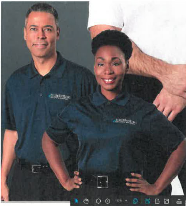
Dark blue polo