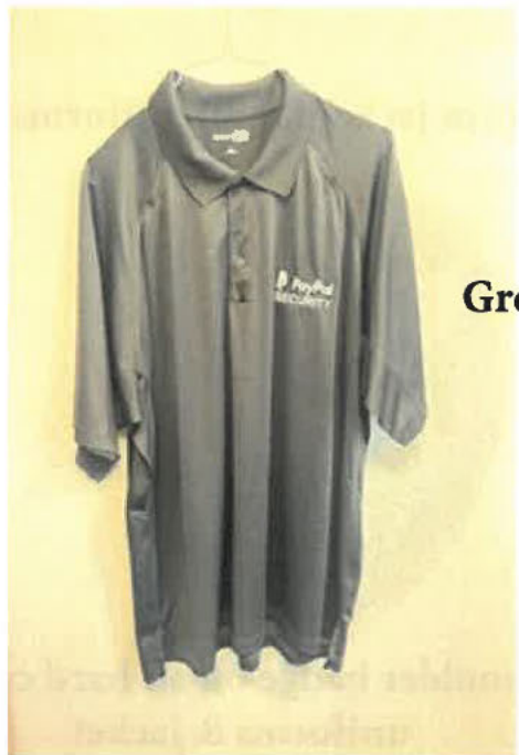
Grey Paypal polo