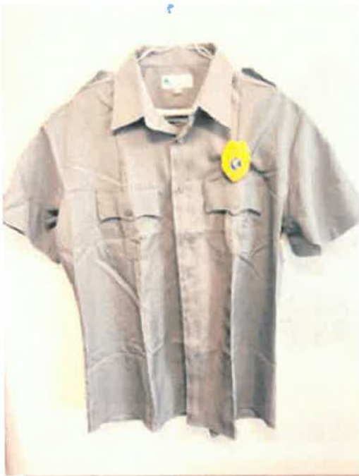
Grey hard profile cover