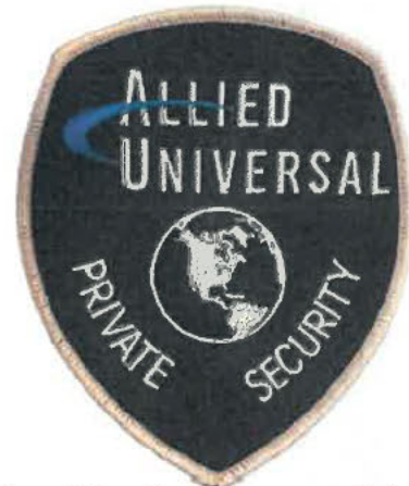
Shoulder badge on all hard cover uniforms & jacket