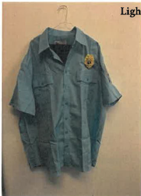
Light blue hard cover profile with the option of long sleeve