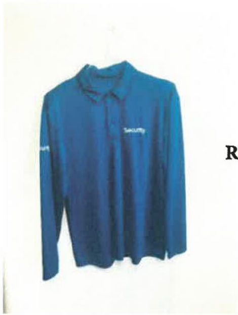
Royal blue polo