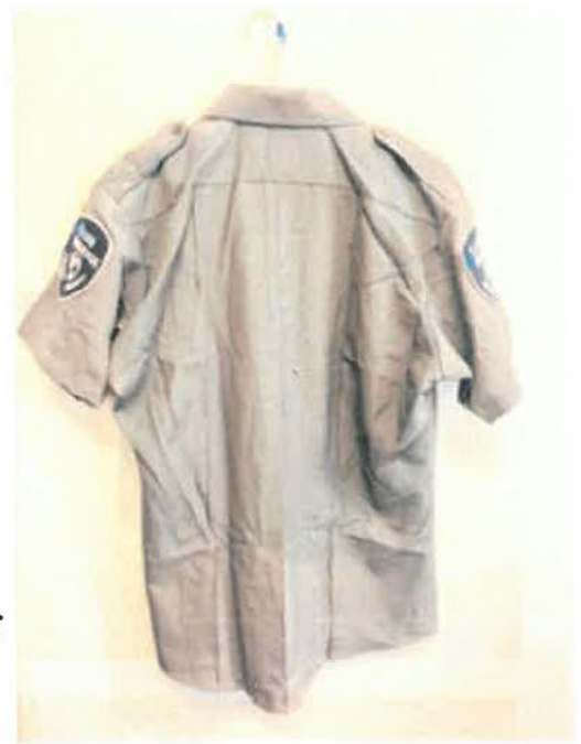
Uniform jacket for all uniforms