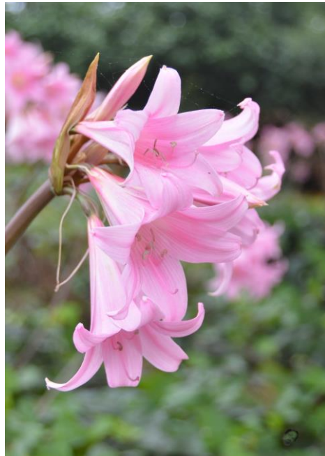
Alice Keck Park Memorial Garden

P.O. Box 1990 Santa Barbara, California 93102 (805) 564-5433 www.santabarbaraca.gov