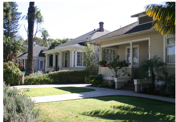
A streetscape in West Downtown features turn of the century Folk Victorian architecture.

Conducted in January of 2012 by Applied Earth Works, Inc., the West Downtown Survey encompasses the area bound by De La Guerra to the north, State Street to the East, and bordered both to the West and the South by the 101 freeway. The survey was completed under the guidance of the HLC and staff of the Community Development Department's Planning Division using methodology and criteria developed by the California Office of Historic Preservation and the National Park Service. The West Downtown Survey concluded that there were two distinct potentially historic districts within close proximity to each other. The Lower De La Vina District , set between Cota and De La Guerra, has its roots in the late 19 th Century and early 20 th . The district is primarily residential, and home to a collection of Victorian and early Craftsman bungalows. The Castillo District , which is slightly younger than the Lower De La Vina District, is also situated south of De La Guerra and is a prime example of the shift from Victorian styles to the Arts and Crafts bungalows that dominate the neighborhood. In addition to these two individually significant districts, many of the properties within the West Downtown Historic District