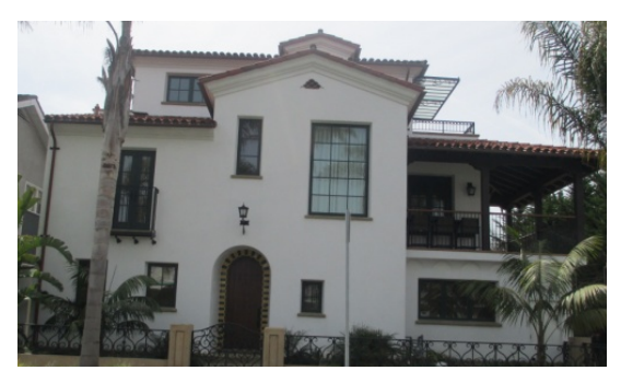
A Spanish Colonial Revival Residence constructed in 1928 that was one of the properties found to be individually significant in East Beach area through the Waterfront Survey.

survey identified properties that were eligible for individual listing as City Landmarks/Structures of Merit, as well as a potential historic district due to the large collection of historic resources at the western end of the City's Waterfront, known as West Beach. In 2013, the contributing properties to the Potential West Beach Historic District were added to the City's Potential Historic Resources List. The individually significant buildings surveyed in the area that have not yet been designated as historic resources will be added to the City's Potential Historic Resources list in the winter of 2014. If you would like to see the original survey documents, please contact the Urban Historian, Nicole Hernandez at 805-564-5470.