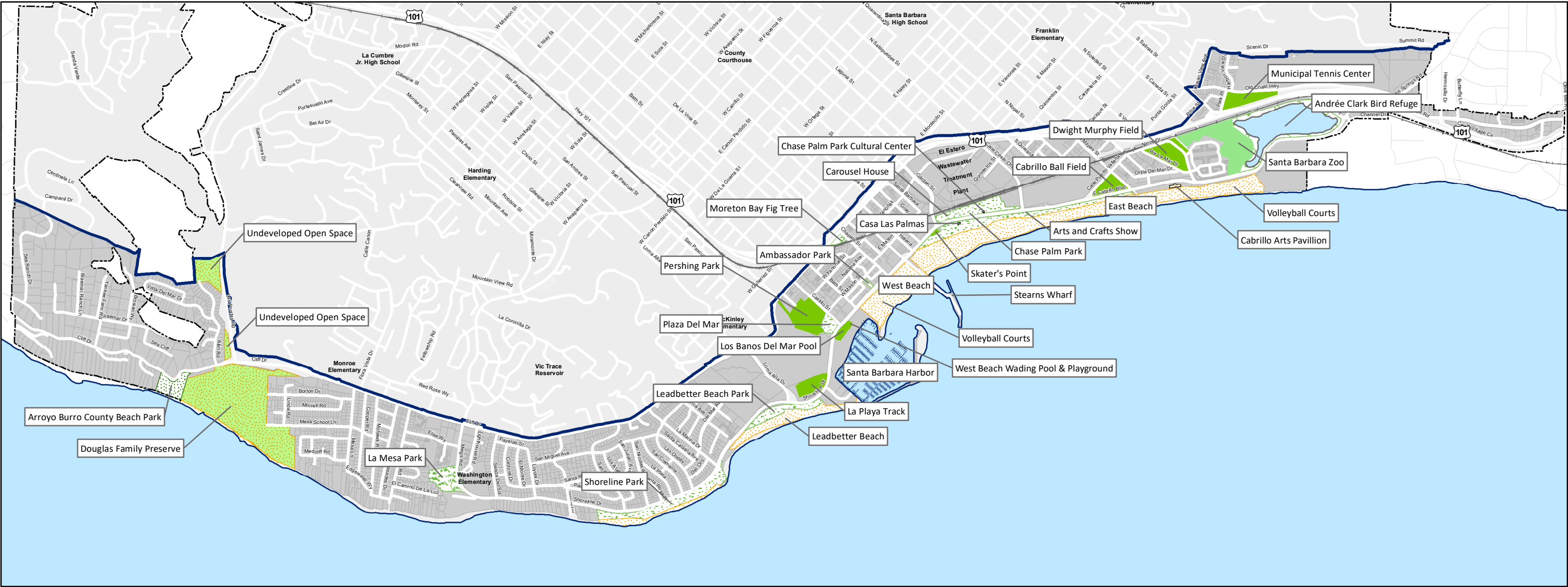
FIGURE 3.2-1 RECREATION AND SUPPORT FACILITIES