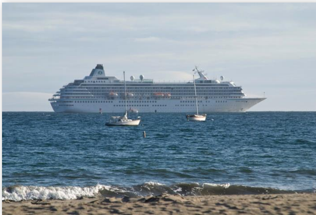
VISITING CRUISE SHIP

The 80-acre Santa Barbara Zoo is a private, non-profit corporation located on land owned by the City. The Zoo offers educational programs (camps, classes, and field trips) and special events. The 42-acre Andrée Clark Bird Refuge, adjacent to the Zoo, is a passive park with a lake and artificially modified estuary. There is a small off-street parking lot, bike racks, viewing platforms, benches, and a 500 square foot area of outdoor fitness stretch equipment. The California Coastal Trail borders the Refuge, where recreational use is balanced with habitat protection.