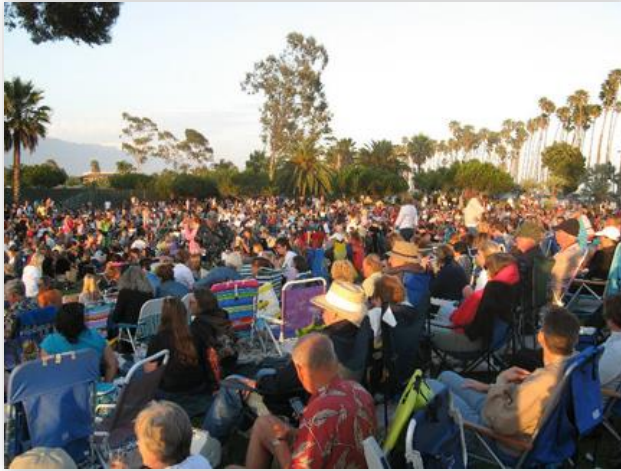
CONCERT IN THE PARK

Chase Palm Park is on both sides of Cabrillo Boulevard. The north side is a large community park with many facilities, including the Carousel House rental facility that formerly housed the Allan Herschell Carousel. In July and August, up to 5,000 people come