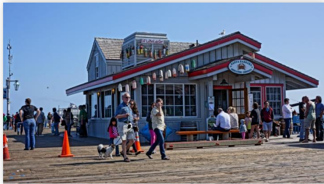
THE POPULAR STEARNS WHARF

Both Stearns Wharf and the Harbor provide low-cost recreational fishing opportunities, viewing areas, and a quiet water area for recreational boating. More details about Stearns Wharf and the Harbor boating and fishing facilities are provided in Chapter 2.2 Coastal-Dependent & Related Development .