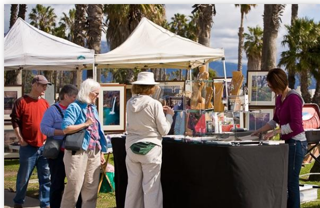
ARTS AND CRAFT SHOW

The Arts and Crafts Show has been a fixture at the Waterfront since 1966. On Sundays and major holidays, approximately 200 Santa Barbara County resident artists set up temporary booths and displays along the ocean side of Cabrillo Boulevard from Stearns Wharf eastward. It is a popular attraction and is the only continuous, non-juried arts festival of original drawings, paintings, graphics, sculpture, crafts, and photography in the world. The show is unique in that each artist lives in Santa Barbara County and personally produces each piece for sale.