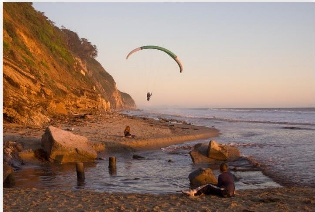
ARROYO BURRO BEACH

Visitor-serving and recreational activities are an important part of the character and economy of Santa Barbara. Because of the attractiveness of the shoreline, a great proportion of the City's visitor-serving and recreational opportunities are concentrated