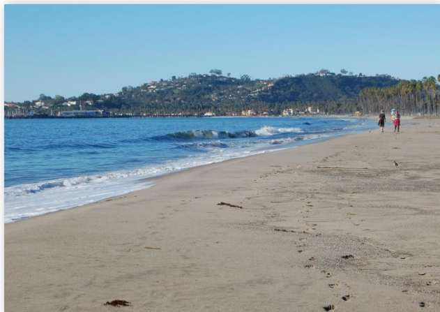
EAST BEACH SHORELINE

seaward of the mean high tide line is available to the public at all times. There are tidelands and submerged lands that were granted to the City of Santa Barbara in a Tidelands Grant originating in 1925 (Chapter 78, Statutes of 1925), as discussed further in Chapter 2.2 Coastal-Dependent & Related Development .