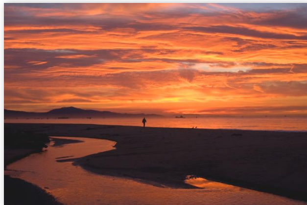
EAST BEACH SUNRISE

One of the fundamental goals of the Coastal Act is to provide maximum public access to the shoreline, along the coast, and to public recreation areas, including protecting existing and providing new public access. Per the Coastal Act, public access to the coast is facilitated with the provision of transit service, commercial facilities within or near residential areas, non-automobile circulation, adequate parking, and by correlating development with the provision of parks or on-site recreation. The Coastal LUP facilitates public access through: