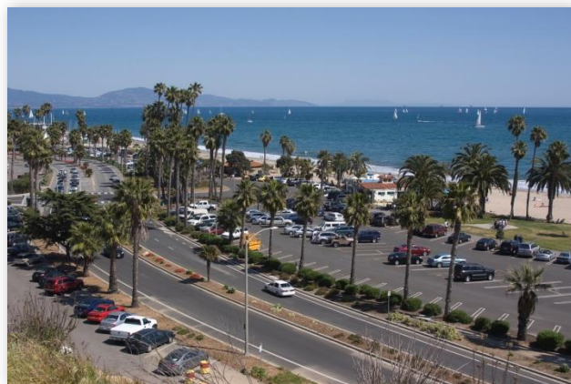
SBCC & LEADBETTER BEACH PARKING LOTS

The provision of sufficient and convenient public parking facilities can maximize public access to the shoreline and coastal recreation areas. Throughout the City's Waterfront area, public parking is appropriately distributed via eleven public parking lots with over 2,400 public parking spaces. In addition, on-street parking is available along much of Cabrillo Boulevard and nearby streets. Along coastal bluffs and beaches to the west, public parking is available in lots at Shoreline Park and Arroyo Burro Beach, and public on-street parking is available to access Thousand Steps, Mesa Lane Stairs, and Douglas Family Preserve. The City's Key Public Access Parking Areas are shown on Figure 3.1-2 Key Public Access Parking Areas . The City's goal is to preserve the supply of existing public access parking in the Key Public Access Parking Areas.