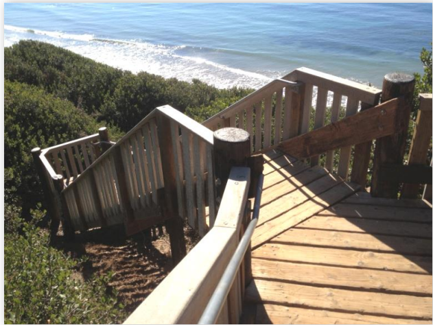
MESA LANE STAIRS