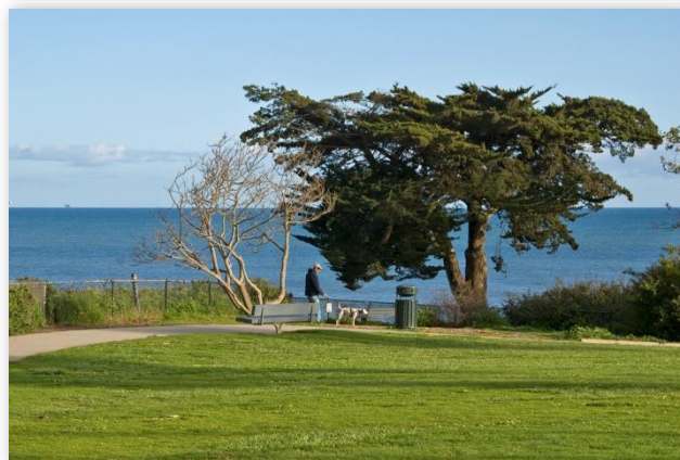
SHORELINE PARK WALKING PATH

Highway 101 traverses the Coastal Zone, serving as a vital regional and statewide transportation link through Santa Barbara. Highway 101, however, forms a circulation barrier between the coastal portion of the City and the inland areas. Where appropriate, Highway 101 development should incorporate measures to increase access and prevent or remove barriers to coastal areas by pedestrians and bicyclists. More information about Highway 101 is included in Chapter 6.2 Highway 101 .