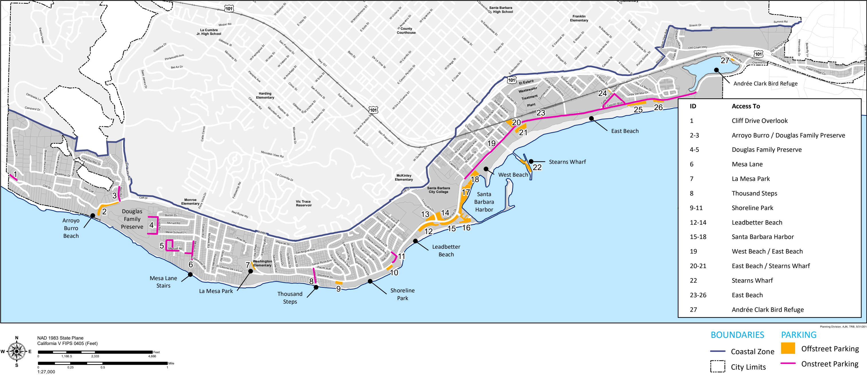
FIGURE 3.1-2 KEY PUBLIC ACCESS PARKING AREAS

Note: Southern city limits extend into the Santa Barbara Channel. See Official Annexation Map for official city limit boundary. The Coastal Zone Boundary depicted on this map is shown for illustrative purposes only and does not define the Coastal Zone. The delineation is representational, may be revised at any time in the future, is not binding on the Coastal Commission, and does not eliminate the possibility that the Coastal Commission must make a formal mapping determination. This map depicts key public access parking areas for access to the shoreline, coastal recreation, Stearns Wharf and the Harbor in specific locations for illustrative purposes. The parking areas depicted on this map serve multiple areas and purposes and are not reserved solely for public access to specific locations.