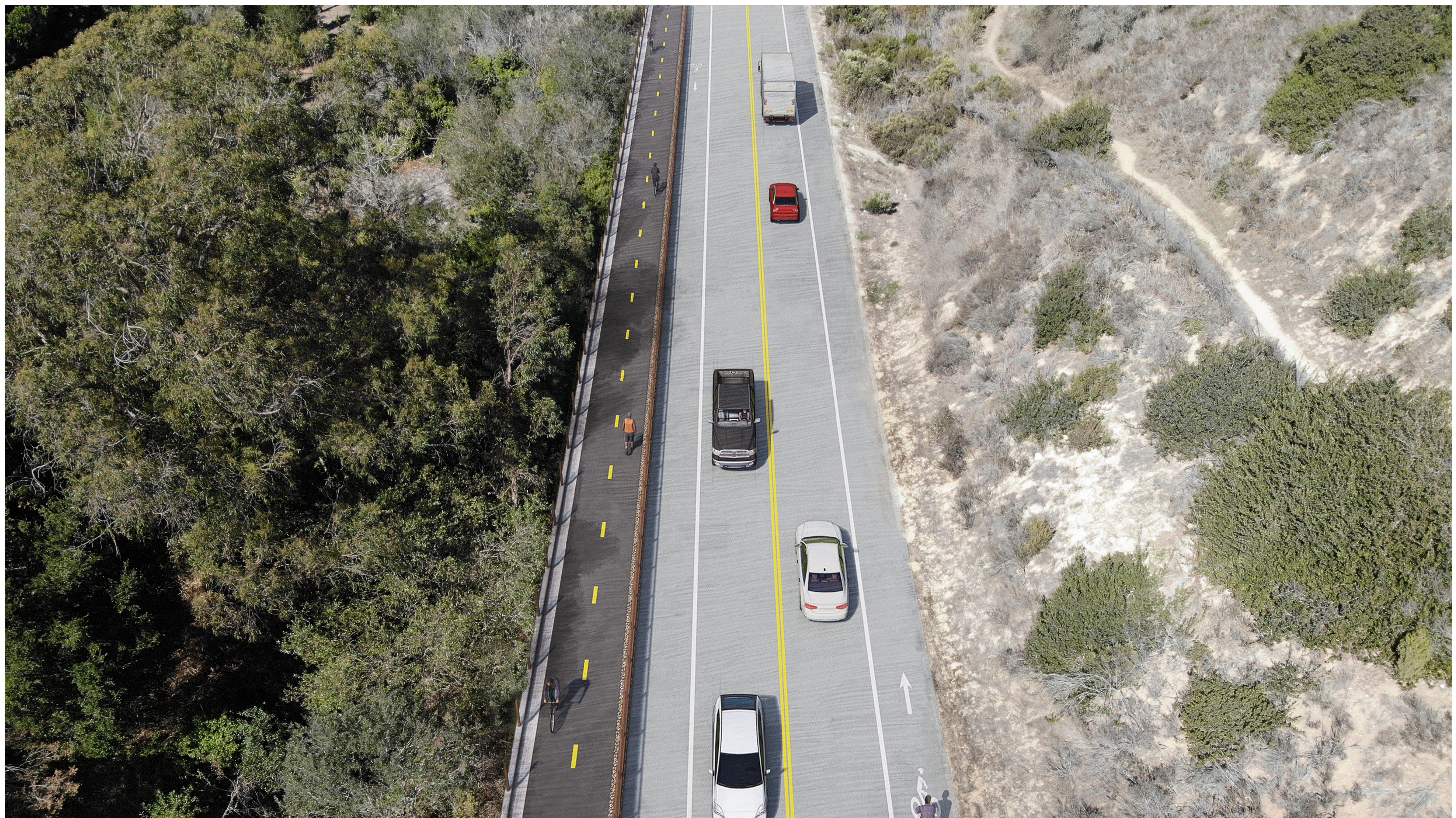
VIEW E: TYPICAL VIEW OF TRAIL ADJACENT TO CALTRANS WALL