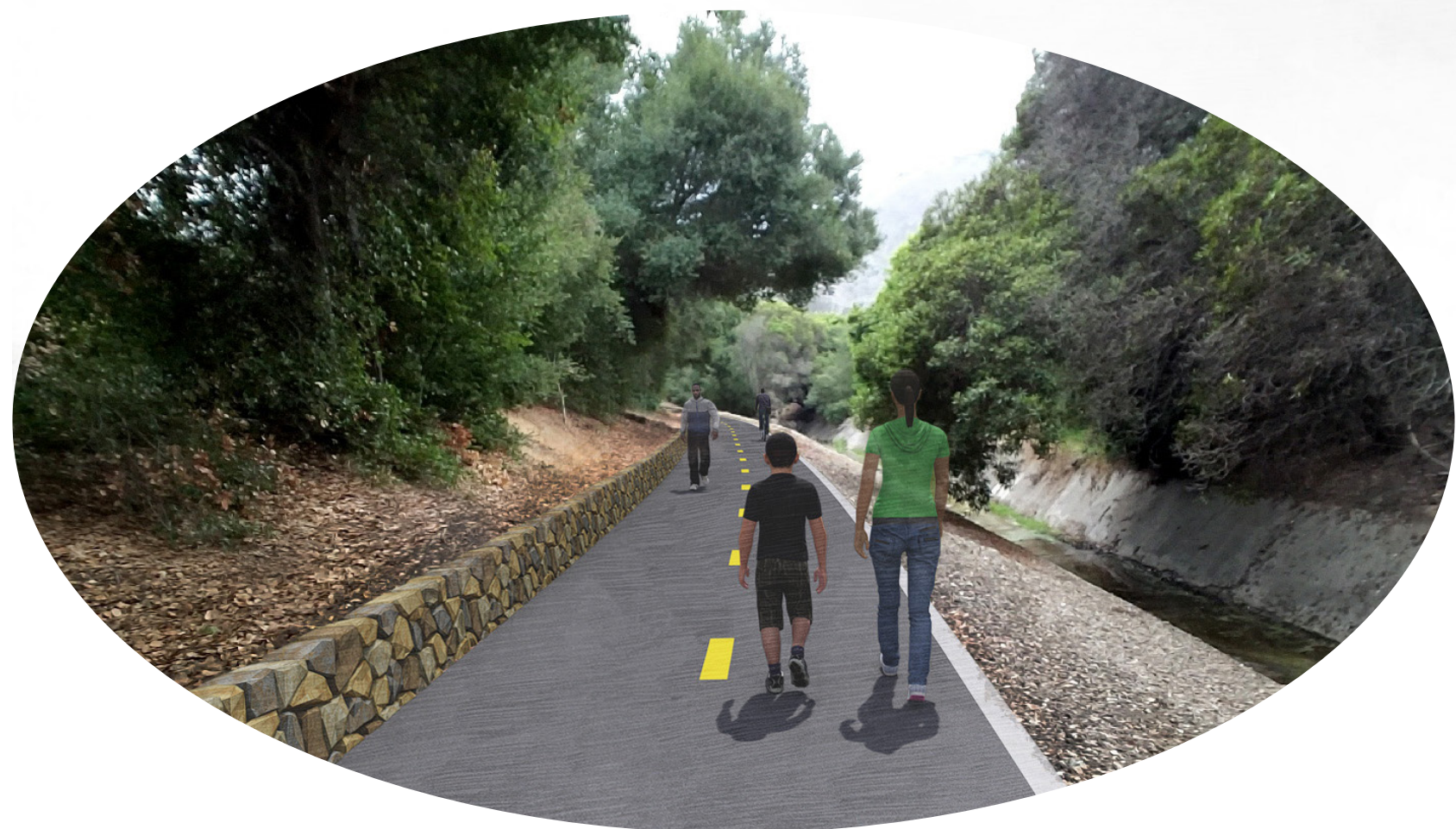
VIEW C: TYPICAL VIEW OF TRAIL ADJACENT TO CREEK