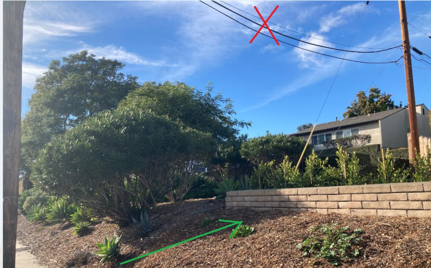
Example Underground Trenching Required Within Utility Easements - Softscape