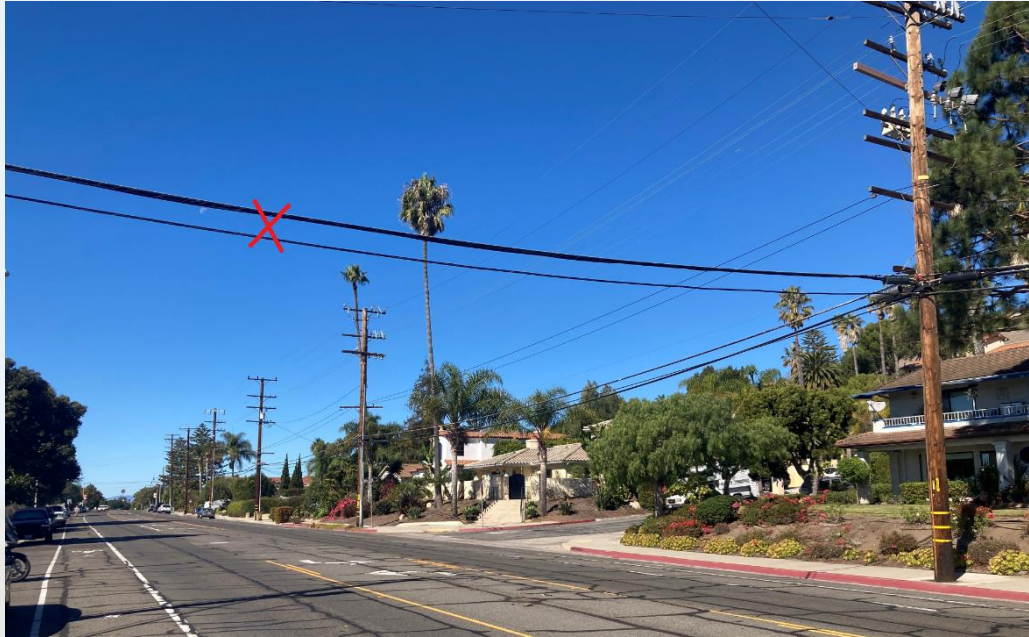
Cliff Drive Near Mira Mesa – Looking Westerly at Poles/Lines to be Underground