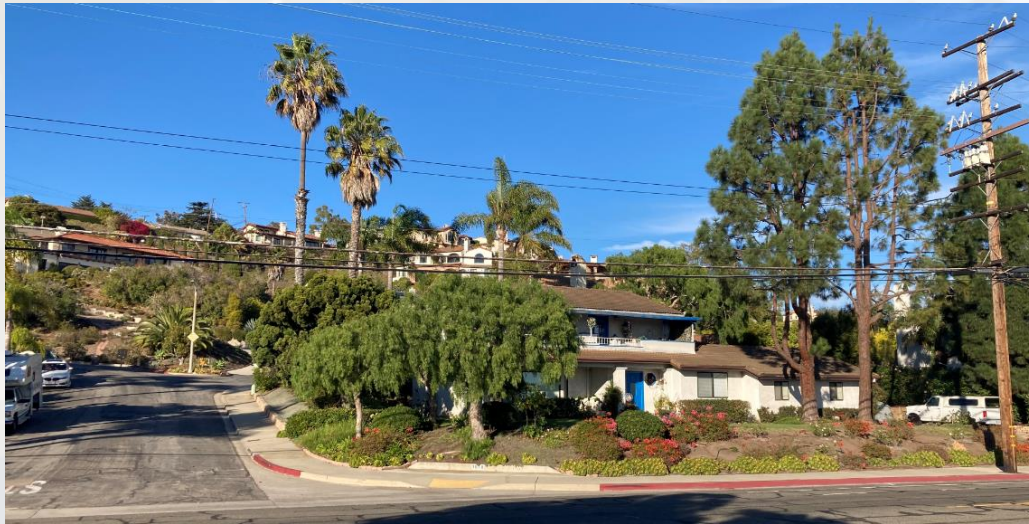
Same Location – Looking Towards Mountains