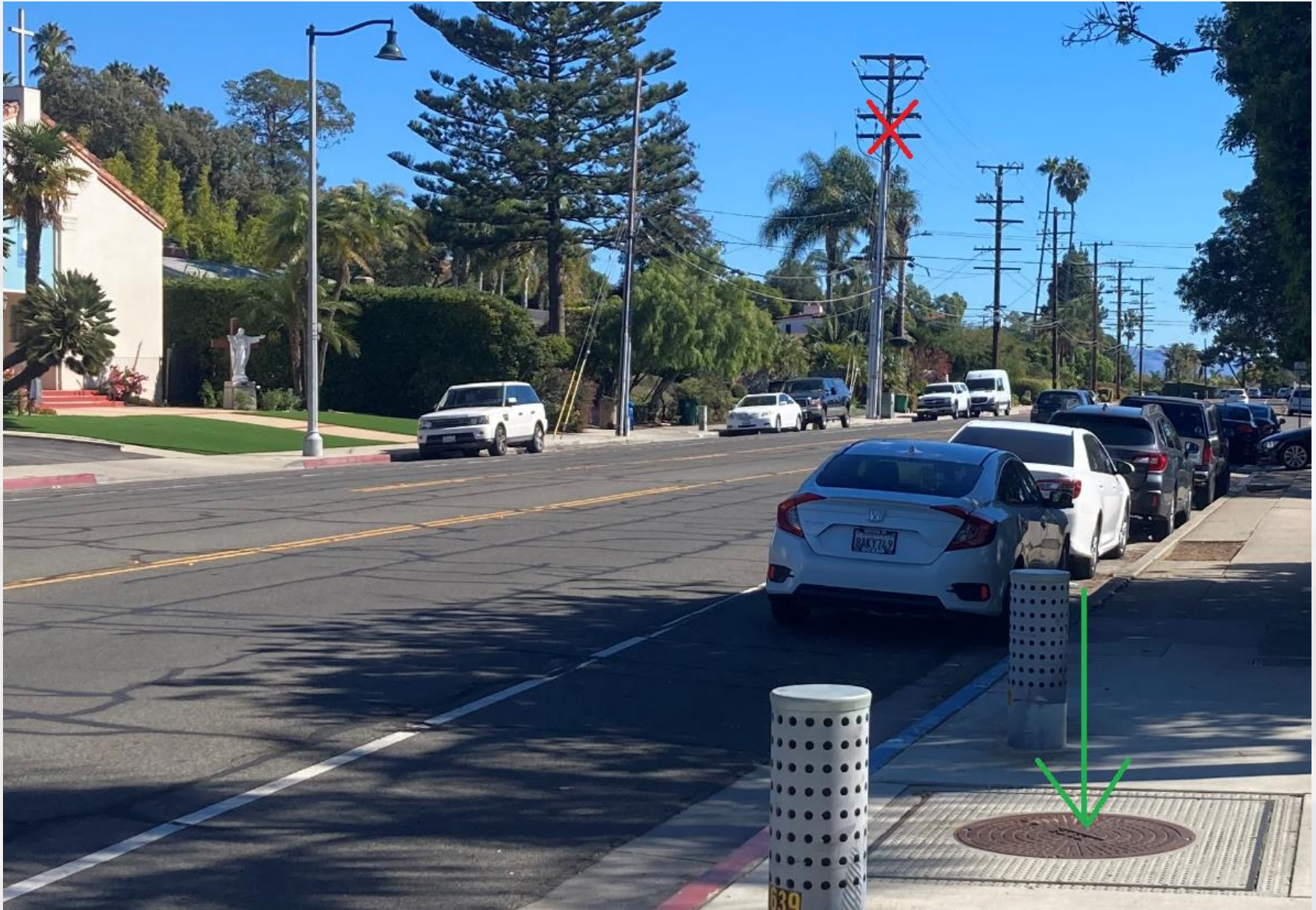
Cliff Drive Near Salida del Sol – Looking Easterly at Poles to be Underground