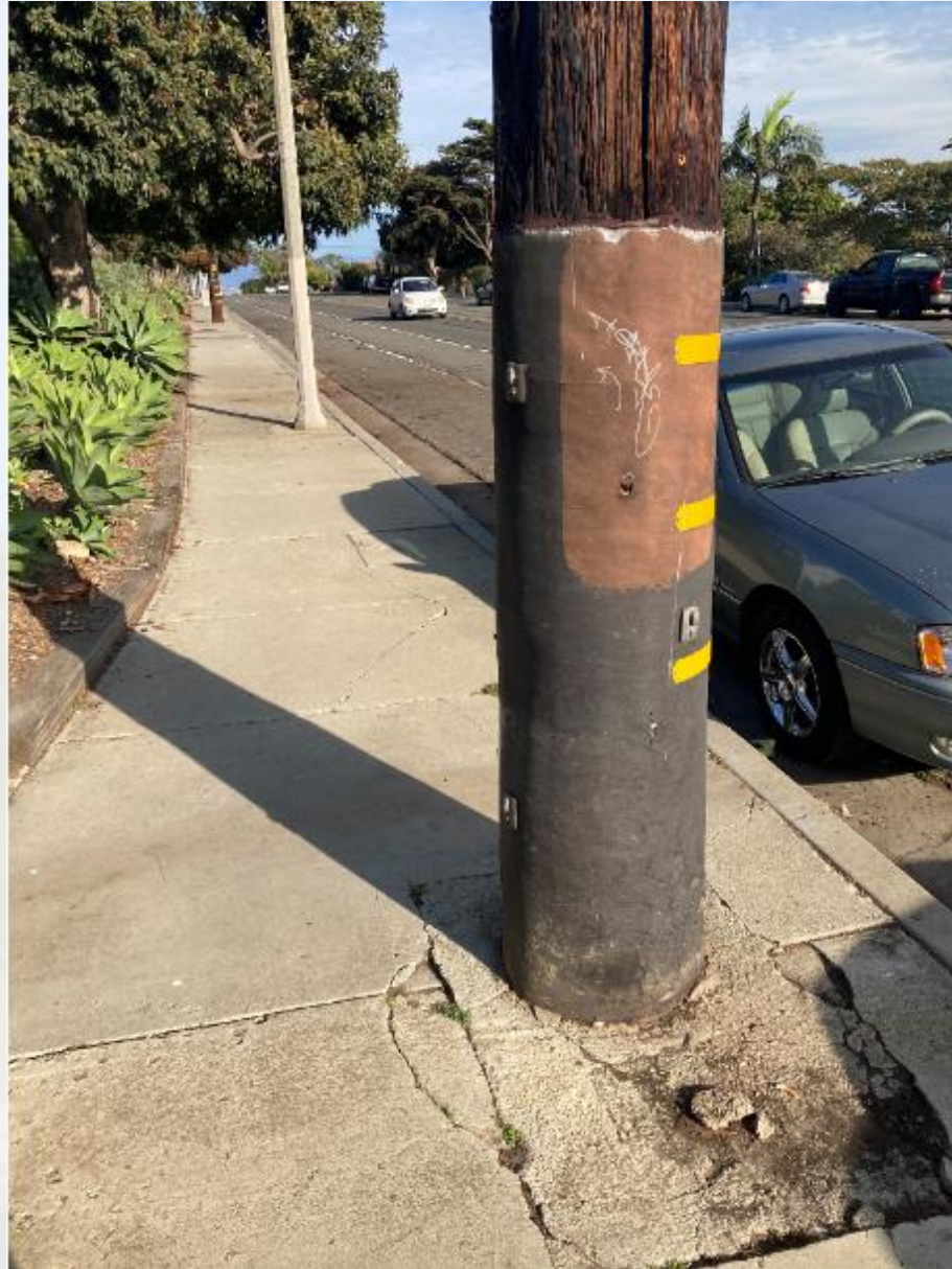
Example “Blighted” Utility Pole And Traffic Safety Need