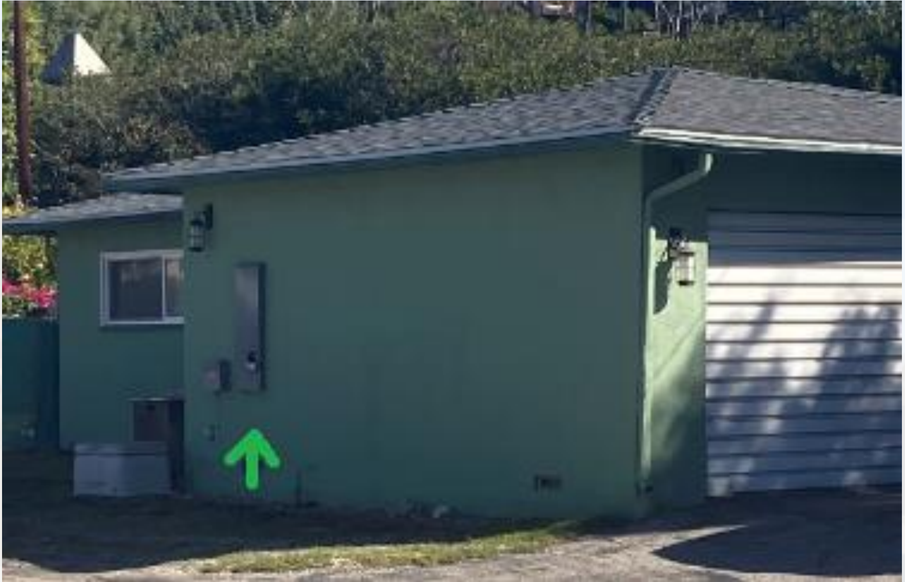
Example Underground Electric Meter – All Properties Within the Boundary on North Side of Cliff Drive Must Convert from Overhead to Underground