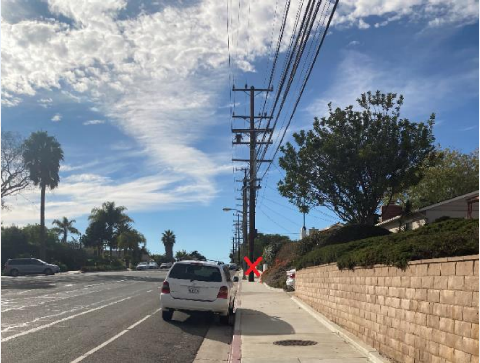
Looking Westerly Near San Rafael Avenue – Improve Sidewalk Access