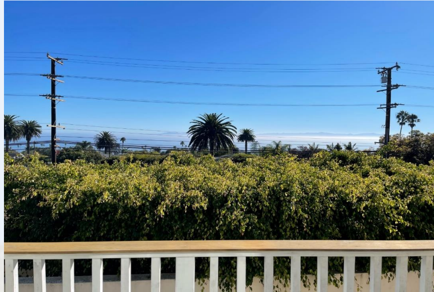
Example Private Property Ocean View Obstruction on La Vista Del Oceano