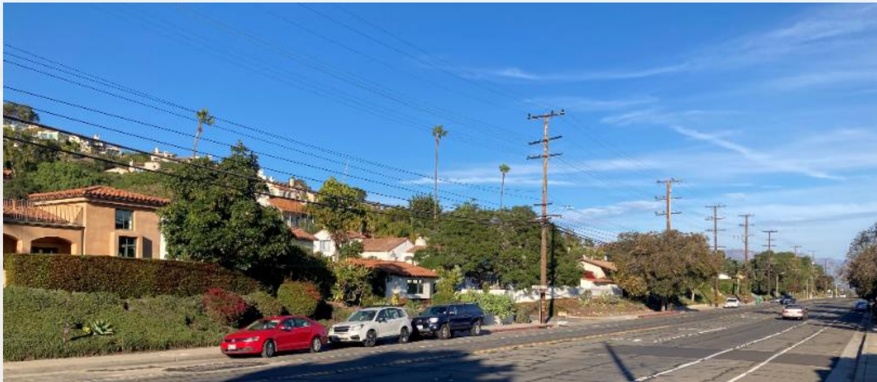
Streetscape and Ocean View Obstructions Near La Vista Del Oceano