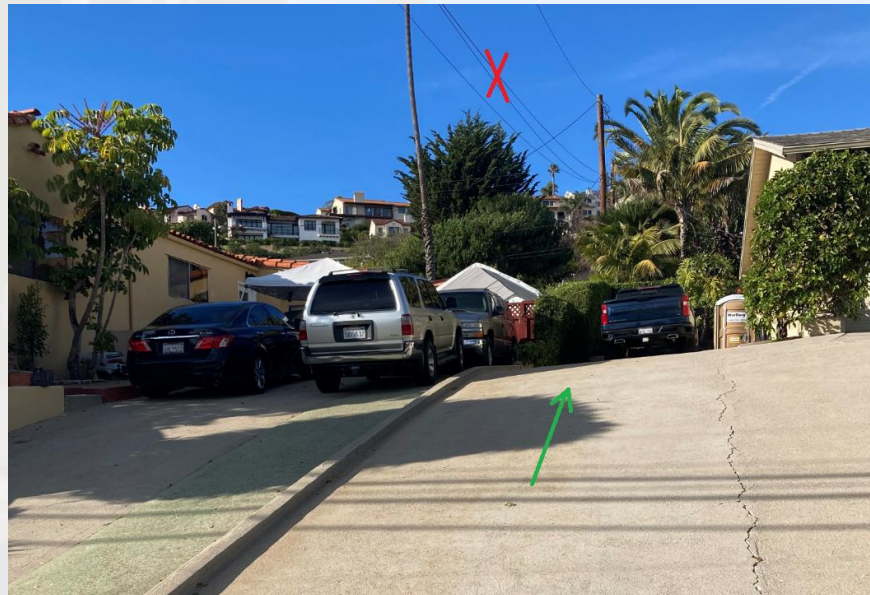
Example Underground Trenching Required Within Utility Easements – Hardscape