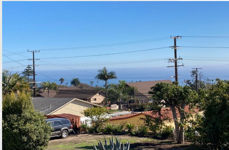
Example Private Property Ocean View Obstruction on La Vista Del Oceano