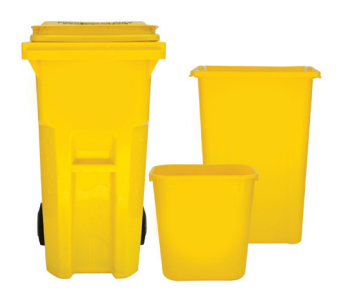
YELLOW FOODSCRAPS BINS

As a participant in the foodscraps program you might find it helpful to utilize these items: