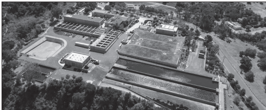
The Cater Water Treatment Plant treats the water received from Gibraltar and Cachuma Reservoirs, producing drinking water for the City and the neighboring water districts of Montecito and Carpinteria Valley.

The City of Santa Barbara's water system represents one of the largest investments in public infrastructure in the City, playing a critical role in providing the foundation for our community to thrive. The City provides approximately 2.5 billion gallons of potable water to its customers annually through three water treatment plants and over 330 miles of water main pipelines.