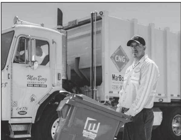
MarBorg is replacing existing trash, recycling, and yard waste cans.

During the months of May and June, MarBorg will continue replacing existing trash, recycling, and yard waste cans (non-wheeled) with easy-to-maneuver wheeled carts for City of Santa Barbara customers. The new trash carts are gray to comply with state regulations regarding statewide container colors (SB 1383). Recycling carts will remain blue and yard waste carts will remain green. Beginning July 1, 2025, all customers will need to wheel carts to the curbside on scheduled service day(s). Carts must be wheeled to the curb by 6:00 a.m. on your service day, or no earlier than the night before. Effective July 1, 2025, in-place service will be available for a proposed fee of $44.89 per month. For details specific to your account or obtaining an in-place waiver due to age or disability, please contact MarBorg at (805) 963-1852.