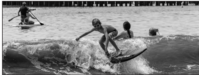
Surfing is one of many activities kids can enjoy this summer.

Families can choose from over 15 camps this summer! Half-day, full-day, and extended care options are available for kids ages 4-17 with topics including art, business, engineering, sports, theater, and water safety. Learn more about camp offerings, scholarships, and registration at SantaBarbaraCA.gov/Camps .