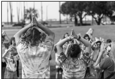
Summer jobs provide great development opportunities for teens and young adults.

The Parks and Recreation Department is recruiting hourly employees to support summer programs and services ahead of peak season. Seasonal positions play a critical role in the operation of summer camps, seasonal aquatics facilities, and event facilities while providing professional development opportunities for teens and young adults. Applications are being reviewed now, and interviews will begin in April.