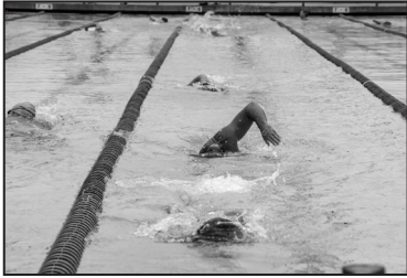
Start or end your day with laps in Los Baños del Mar.

The time change is the perfect excuse to mix up your routine. Los Baños del Mar, Santa Barbara's only year-round public pool, is open for lap swimming seven days a week, with morning, midday, and evening options. The 50-meter beachfront pool is heated to 80 degrees so that you can enjoy a comfortable swim, no matter the weather.