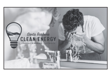
New heat pump water heater program for SBCE customers.

Santa Barbara Clean Energy (SBCE) has launched a new program to encourage the purchase and installation of Heat Pump Water Heaters (HPWHs) and electrical work to prepare for home electrification (Associated Electrical Work). The program also offers fast and free permitting to help contraction.