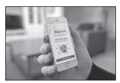
Track water use, get leak alerts, and pay your bill on WaterSmart.

WaterSmart is the City's new website to pay bills online, get water leak alerts, and track hourly water use. Have peace of mind while you're away – keep an eye on your sprinkler system usage from anywhere with cell or Wi-Fi service while you enjoy your vacation. WaterSmart allows you to