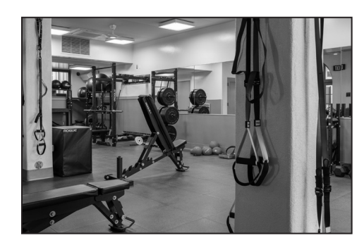
Enjoy access to high-quality fitness equipment with a pass to the Carrillo Pavilion Fitness Center.

Just off the sands of East Beach, this state-of-the-art facility provides a calm, quiet environment perfect for a focused workout. Finish your session with access to locker rooms and showers, or take your workout outside for an ocean swim or beach run. Single-day, 10-day, and unlimited 30-day passes are available to suit every routine.