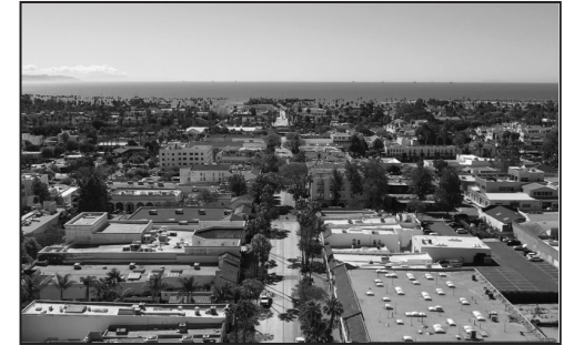
Aerial view of lower State Street and the downtown area.

For more information on Business Taxes visit SantaBarbaraCA.gov/Business/Business-Taxes-Assessments .