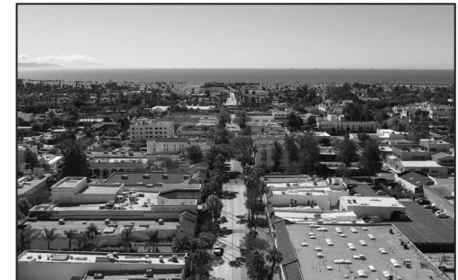
Aerial view of lower State Street and the downtown area.

Para más información sobre impuestos de negocios visite SantaBarbaraCA.gov/es/negocios/impuestos-y-tasas-empresariales .