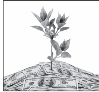
Rebate available to help cover the cost of upgrading lawns to beautiful, low maintenance, water wise gardens.