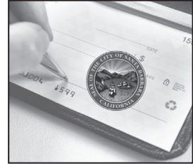
Writing a check for a water bill.

Our mailing address has recently changed. Mailing a payment to the incorrect address causes delays and may result in late fees. Be sure you are mailing your check payment and the remittance stub to: