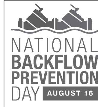
A properly functioning backflow prevention assembly on private property prevents clean drinking water from being mixed with contaminated water.

To learn more about the City's Cross Connection Control Program, or if a BPA is required for your property, visit SantaBarbaraCA.gov/Backflow or call (805) 564-5575.