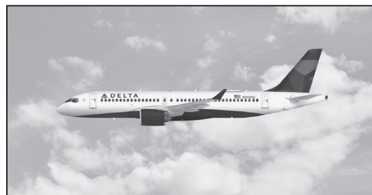
Delta Air Lines will offer daily nonstop service to ATL and SLC.