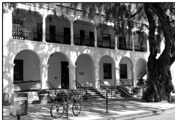
Recommended 2025 budget for the 2025 Fiscal Year has been released.

The City of Santa Barbara has officially unveiled its recommended budget for Fiscal Year 2025 (July 1, 2024, to June 30, 2025), in accordance with the City Charter. This comprehensive budget encompasses an introductory message from the City Administrator, detailed breakdowns of revenue and expenditures by fund and department, capital priorities, and performance indicators.