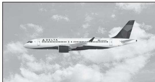
Delta Air Lines will offer daily nonstop service to ATL and SLC.

Sign up today! Register your account on the WaterSmart portal at SantaBarbaraCA.gov/WaterSmart and enter your account number and service address zip code. For additional information about, please visit SantaBarbaraCA.gov/AMI or call (805) 564-5460.