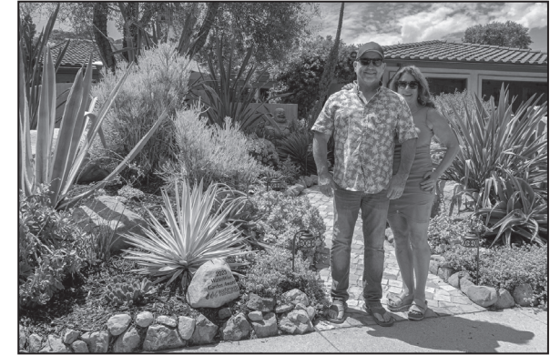
Enter the 2024 WaterWise Garden Contest by April 30th!

Do you have a beautiful, water wise front yard? The 2024 WaterWise Garden Recognition Contest celebrates and recognizes beautiful, water efficient residential gardens throughout Santa Barbara County. These gardens serve as an example of what is possible when we design our landscapes to better use our most precious natural resource: water. Easily submit photos and an application online by April 30th. A City of Santa Barbara water customer will be selected for a winning garden, which will then be entered into the Countywide grand prize. For more info and to apply: WaterWiseSB.org/GardenContest .