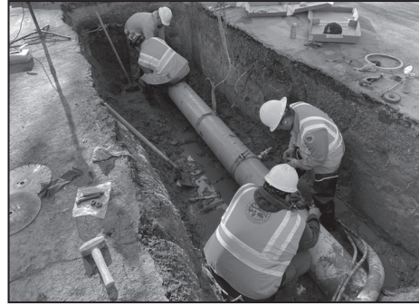
Water and sewer mains are some of the City's largest assets and are priority areas for this rate proposal.

Santa Barbara's water and wastewater systems represent some of the largest public infrastructure investments in our City. To implement a vital, long-term plan to replace the aging infrastructure for water and wastewater, and to ensure reliable, 24/7 service, the City is proposing annual rate adjustments over the next four years. This is based on the cost to provide services to ensure rates are sufficient to: