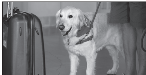
The presence of therapy dogs has been shown to reduce stress and anxiety, promote relaxation, and elevate moods.

After a great response from their special holiday visits, Santa Barbara Airport is excited to welcome back Therapy Dogs of Santa Barbara! Their team of trained therapy dogs will be visiting SBA on a regular basis to greet passengers and help ease the stress of travel. Keep an eye out for their purple gear for a chance to say hello! To learn more about the program, visit FlySBA.com/TherapyDogs .