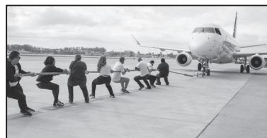
Teams of 10 compete to pull a 100,000 pound airplane.

Leadbetter Beach Park has reopened following the park's first turf renovation since it was developed in 1965. Work included regrading the grassy areas of the park to create a safer, more even surface before installing 1.2 acres of new grass. The Parks and Recreation Department also installed new barbecues and refreshed the landscaping during the closure.