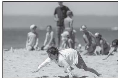
Junior Lifeguards is one of many camps offered by Parks and Recreation this summer.

The City's lineup of 2024 summer camps is now live, with dozens of camps to choose from for ages 4-17. Half-day, full-day, and extended care options are available with topics including art, business, engineering, sports, theater, and water safety. Registration will open on Friday, February 2, and some camps are expected to fill on registration day.