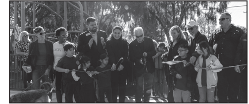
An official ribbon cutting marked the reopening of Eastside Neighborhood Park.

A ribbon-cutting event marked the reopening of Eastside Neighborhood Park after a multi-phase park improvement project. Students from neighboring Franklin Elementary School assisted community leaders, community members, and City staff in cutting the ceremonial ribbon before running to play on one of the park's new playgrounds.