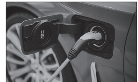
Check for rebate availability.

*This rebate only applies to electric vehicles with an MSRP less than $80,000. SB Clean Energy customers must be in good standing to qualify. Each SB Clean Energy account is eligible for one rebate.