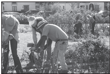
Volunteers During Rose Pruning Day.

The Parks and Recreation Department will host its annual Rose Pruning Day on Saturday, January 13, at Mission Historical Park. A January tradition for almost 40 years, volunteers are invited to spend the morning pruning the approximately 1-acre garden in preparation for the spring growth. The Department is seeking up to 150 volunteers. All ages and skill levels are welcome,