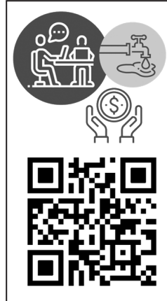
Scan QR Code here to learn more and access the survey.

Please take the short Water Affordability Community Survey, available online in English and Spanish. Use the QR code or visit the project website to learn more and access the survey: SantaBarbaraCA.gov/WaterAffordability .