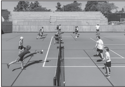
Register now to keep the whole family active during holiday break and New Year's week.

The City Parks and Recreation Department offers programs for all ages looking to stay active this fall and winter season. For youth, options include pickleball, beach volleyball, and basketball camps offered during the holiday break from school, December 18-22. In the new year, pickleball and beach volleyball camps are offered again from January 2-5.