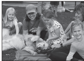
The mission of Therapy Dogs of Santa Barbara is to empower people to live more fulfilling lives through the human-animal bond.

Exact dates and times will vary, but passengers can recognize the volunteers and therapy dogs by their purple branded outfits. For more info, visit FlySBA.com/TherapyDogs .