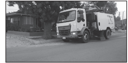
Street Sweeping Hotline: (805) 897-1903.

When a holiday is observed on a weekday, street sweeping (and parking enforcement related to street sweeping) in the City of Santa Barbara is cancelled. When sweeping is cancelled, there will be no shift in the schedule and no makeup days. Sweeping will resume on the regular schedule, so please follow the posted signs in your neighborhood to ensure you don't receive a ticket.