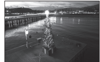
We're always there for you at SantaBarbaraCA.gov

For detailed closure information by department, please visit: SantaBarbaraCA.gov/HolidayClosures .