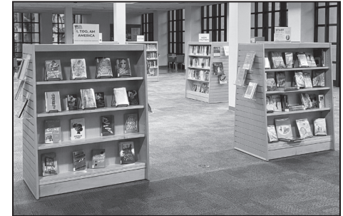
In preparation for the new schedule, all Library locations will close at noon on October 4 to facilitate staff training.

The Santa Barbara Public Library received additional funding for staffing from City Council during the FY24 budget process in order to restore open hours on evenings and weekends. SBPL will be implementing expanded hours beginning October 8, 2023 at Central and Eastside Libraries.