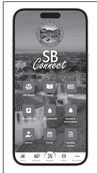
SB Connect is free and available now in the Apple App and Google Play stores.

For further project details visit: SantaBarbaraCA.gov/StateStUndercrossing .