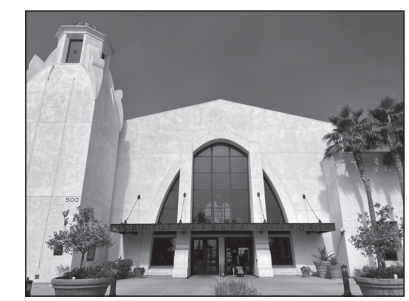
Summer travel season is upon us! Remember: arrive early and be prepared.

To view all of SBA's nonstop routes, visit flysba.com/fly-sba .