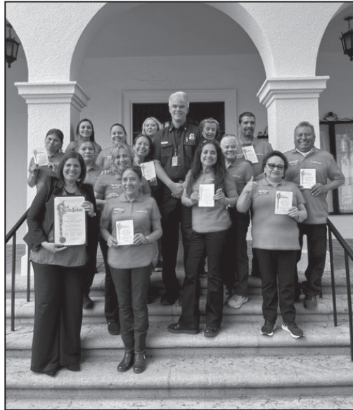
Graduates join City staff on the steps of City Hall after City Council recognized their accomplishment in graduating the Advanced Spanish language CERT program.

Language CERT Advanced Academy. Immigrant Hope SB provides English and Civics classes as well as legal assistance to immigrants. The City Fire Department's Bilingual Public Outreach Coordinator taught and translated the curriculum specifically for this Academy.