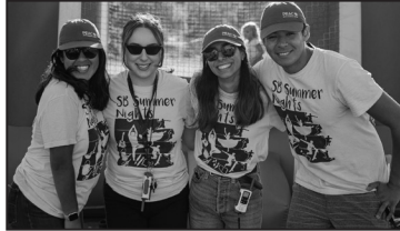
Summer Nights provides teens free fun food and entertainment each week.

The City Parks and Recreation Department has announced the return of Summer Nights, a 6-week series of community events designed to bring local partners together to provide free activities for Santa Barbara's teens. Youth ages 12-17 can enjoy music, food, arts, sports and games each week.