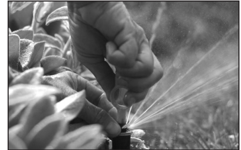
Use the Irrigation Startup Checklist to prepare your irrigation system for summer.

With the summer months approaching, you may be turning your irrigation system on after the wet spring we experienced. While doing so, it is important to inspect the valves, sprinkler heads, water lines, and to properly schedule your timer. Following these simple steps now will go a long way towards saving you water and money.