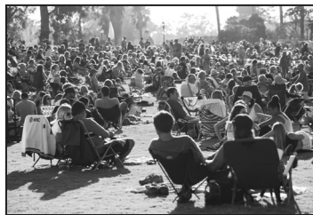
Family-friendly concerts are a summer tradition at Chase Palm Park.

The City Parks and Recreation Department has announced the return of Concerts in the Park. These free, family-friendly events bring musical acts to the Great Meadow in Chase Palm Park every Thursday in July from 6 p.m. to 7:30 p.m. A cherished summer tradition, large crowds have been enjoying a range of musical entertainment at Chase Palm Park since its inception in 2000.