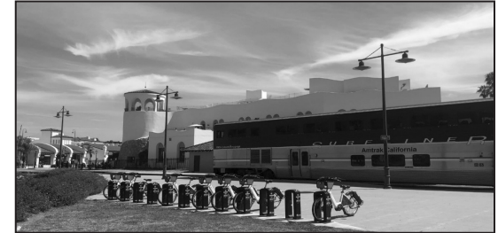
To date, riders have travelled over 900,000 miles on BCycle bikes.

Have a location where you'd like to see a bike share station? Contact BCycle at SantaBarbara@BCycle.com to request a station near you.