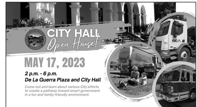
Come on out to De La Guerra Plaza Wednesday, May 17 from 2 p.m. to 6 p.m. See you at the City Open House!

Take a tour of Council Chambers, Touch-a-Truck, play games and meet City Councilmembers. It's free and family-friendly with entertainment and treats for the kids (while supplies last).