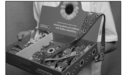
To learn more and request Sunflower materials, visit www.flysba.com/sunflower .

Globally, one in seven people live with a disability - and many of those are non-visible. This spring, Santa Barbara Airport is joining 200 airports across the world to offer the Hidden Disabilities Sunflower Program to passengers. By wearing a Sunflower lanyard, passengers with non-visible disabilities can indicate to staff that they may require a little extra patience, time, or assistance during their travel experience.