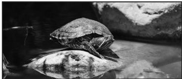
The current population of red-eared sliders is estimated to be over 200.

86 red-eared sliders have been relocated from Alice Keck Park Memorial Garden to the Turtle and Tortoise Rescue in Arroyo Grande. They will be included in a new outdoor exhibit at the five-acre sanctuary to educate children and adults about animal diversity and conservation.