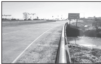
This project currently has a timeline of two years, and updates will be shared as they're available.

In mid-April, CalTrans will begin construction on Highway 217 which may impact access to the Airport. The Sandspit Road on and offramps may be periodically closed as crews replace the bridge above San Jose Creek. Passengers traveling to and from SBA will be advised to use the Highway 101/Fairview Avenue exits or an alternate route to access the Terminal during this time.