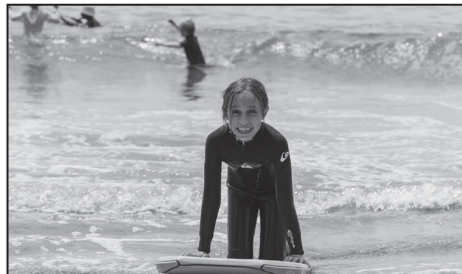
Many camps are expected to fill on registration day!

For more information, please visit SantaBarbaraCA.gov/Rebates .