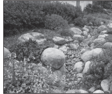
Rebate available to help cover the cost of upgrading lawns to beautiful, low maintenance, water wise gardens.

Would you like to save money on your water bill and have a beautiful, colorful garden? Take advantage of the City's Sustainable Lawn Replacement Rebate to replace your water-thirsty lawn with water-wise and California native plants.