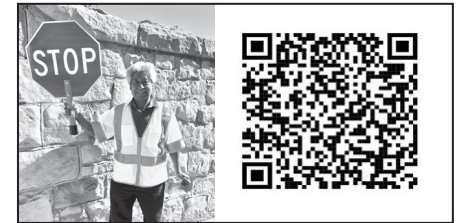
Become a crosswalk hero today!

For more information, please contact the Downtown Parking office at (805) 564-5656 option 2, or scan the QR Code to apply.