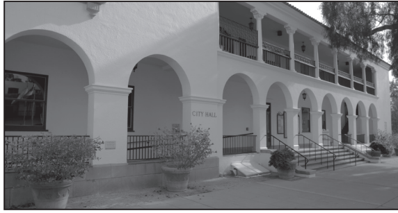
The City Hall Open House will provide opportunities to learn about City government in a casual atmosphere with family-friendly activities.

Learn about various City efforts to create a pathway toward smart government in a fun and family-friendly environment at the City Hall Open House from 2 to 6 p.m. on March 10 at De La Guerra Plaza at City Hall. (Rain will reschedule event)