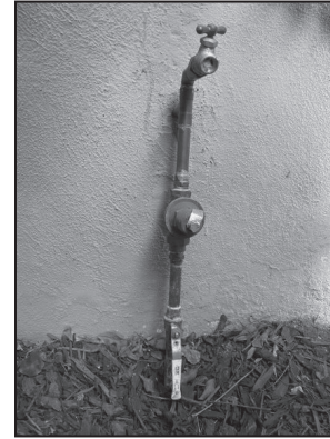
Water pressure regulators are an important part of your home plumbing system and adjust water pressure to the appropriate level for private plumbing: 45-65 PSI. Most manufacturers and plumbing professionals recommend replacing the valve every 5 years.

Water pressure regulators are an important part of your home plumbing system and are designed to adjust water pressure to the appropriate level for private plumbing. In some cases, lowering water pressure can save water, help prevent leaks, and extend the life of your plumbing.