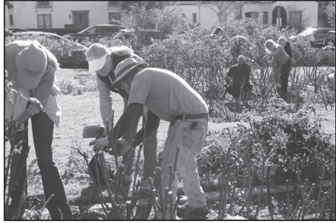
Volunteers are vital to helping maintain the rose bushes year to year.

The City of Santa Barbara Parks and Recreation Department will host their annual Rose Pruning Day on Saturday, January 14, 2023, from 9 a.m. to 1 p.m.