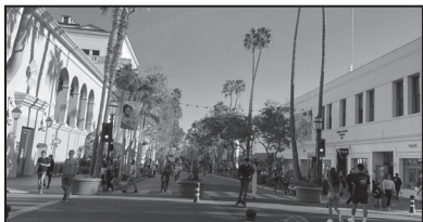
Help “Create State” at one of the City's upcoming community design workshops.

Join one of our upcoming community design workshops on December 9 and 10 at 821 State Street. Workshops will each be approximately 3 hours and provide members of the public the opportunity to design the project area, incorporating a variety of activities and transportation opportunities. Additional information, including workshop times, can be found at the State Street Master Plan website: https://StateStreet.SantaBarbaraCA.gov .