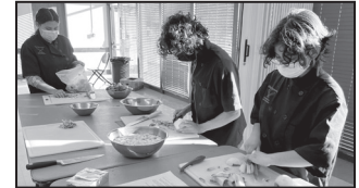
High school students wanting to explore the culinary arts can apply for the Chef Apprentice Program.

The City of Santa Barbara Parks and Recreation Department is now accepting applications for the 2023 Chef Apprentice Program.