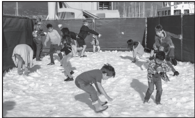
View one of Santa Barbara's signature holiday events and get into the holiday spirit.

On December 11, come enjoy one of Santa Barbara's free signature holiday events – the 36th Annual Parade of Lights.