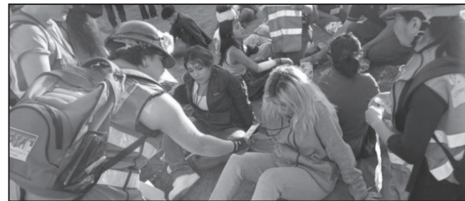
Two classes recently graduated from the Community Emergency Response Team Program.

The Community Emergency Response Team (CERT) Program educates people about disaster preparedness for hazards that may impact their area and trains them in basic disaster response skills, such as fire safety, light search and rescue, team organization, and disaster medical operations. Using the training learned in the classroom and during exercises, CERT members can assist others in their neighborhood or workplace following an event when professional responders are not immediately available to help.