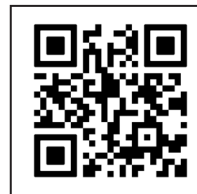
Make your voice heard by taking the State Street

A public bilingual survey for the State Street Master Plan is open and can be found at the QR code here or at the State Street Master Plan website: https://StateStreet.SantaBarbaraCA.gov . Please take a few minutes to complete the survey, share your thoughts for how to make downtown our vibrant City center and help “Create State.” The survey will be available until December 12.