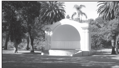
Plaza del Mar Band Shell will soon undergo restoration.

The restoration of the historic Band Shell aims to provide a fully functional performance space and revitalize Plaza del Mar as a destination for music, theater, dance, and celebrations.