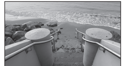
Thousand Steps, historic beach access stairway is open once again after significant safety repairs.

Thousand Steps, a historic beach access stairway in the Mesa neighborhood, has reopened after a six-month closure. During that time, the City of Santa Barbara Parks and Recreation Department made significant safety repairs and improvements to the popular landmark, which serves as one of three public beach access stairways in the City.