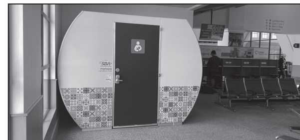
Learn more about what Santa Barbara Airport has to offer to its passengers at www.FlySBA.com .

Santa Barbara Airport (SBA) is proud to announce the newest amenity for a traveling parent in need of a private space to breastfeed or pump while utilizing our Terminal, a secure and private Lactation Pod. This new facility can be found on the second floor of the Terminal building, past the TSA Security Check Point, and just to the right of Gate 2.