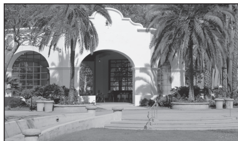
There is a diverse range of indoor and outdoor rentals to meet the needs of community members hosting year-end picnics, parties, and meetings.

Looking for a place to host your holiday party or year-end meeting? The Parks and Recreation Department offers a 20% discount on venue rentals to all City of Santa Barbara residents and nonprofits. Available venues include beachfront properties, historic landmarks, community centers, and group picnic sites. Learn more at SantaBarbaraCA.gov/Venues