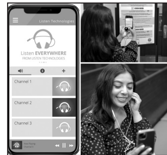
Get free audio assistance or translation to hear meetings in English or Spanish.

Now it's easier than ever to get involved with your City Council, with real time English or Spanish translation or audio assistance at Council meetings, with the Listen Everywhere App. It's as easy as scan, connect, open, and listen. Scan the QR code and download the free Listen Everywhere App. Connect to the City Hall Wi-Fi. Open the app and select your preferred language. Plug in your headphones and follow the meeting. Give it a try at the next City Council Meeting. You'll find an informational poster outside Council Chambers with more details.