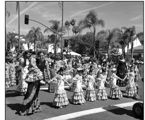
The Santa Barbara Parks and Recreation Department is proud to provide the children of our community with this special opportunity. Viva La Fiesta.

After a two-year hiatus, the beloved Children's Fiesta Parade is back! The parade, to be held on Saturday, August 6, is now in its 90th year, and has been a community tradition for generations. Each year, new families join families who have proudly participated in the Children's Fiesta Parade for more than five generations. This year's theme is Todos juntos en familia ("All Together as a Family,") so gather your family and friends and make plans now to watch the festivities along Cabrillo Boulevard.