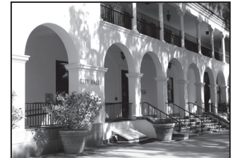
New City Hall Hours.

The doors to City Hall will now be unlocked at 9 a.m. and locked at 3 p.m. City Hall is open daily, Monday through Friday, with the exception of closures every other Friday and federal holidays.