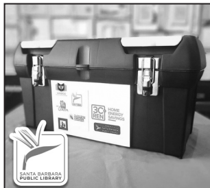
The Library of Things is a collection of items you might not expect to find at a library that you can check out for one to three weeks at a time.

Visit SBPLibrary.org/energy-kit for more information on how to check out the Home Energy Savings Kit.