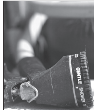
Hoses must be equipped with an automatic shut-off nozzle when in use, including washing vehicles and boats.

Thanks to our community's continued commitment to water conservation and the City's investment in our diversified water supply, Santa Barbara's water outlook is good, even if extreme dry conditions persist for several years. To learn more about drought planning and conservation programs, please visit SantaBarbaraCA.gov/Drought or call (805) 564-5460.