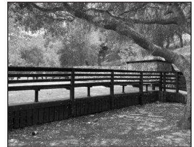
Dance Floor perimeter

Originally built in 1926 for a gala honoring England's Prince George, the well-loved community spot now hosts a diverse array of dance and fitness programs every week.