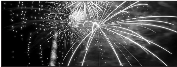
Independence Day Events Blast Back to the Waterfront.

If you're looking for somewhere to celebrate this Independence Day, there'll be no better place than the Santa Barbara Waterfront. A full slate of festive, fun, and family-friendly events and activities are planned throughout the day, including the return of free live music and dance performances!