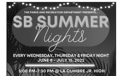
Summer Nights is open to all teens ages 13-16, families are welcome

The Parks and Recreation Department has collaborated with the Santa Barbara Unified School District and other community agencies to offer a program at La Cumbre Junior High to give teens a fun place to hang out in the evenings. Every Wednesday, Thursday and Friday night, 5:00 – 7:00 p.m. through July 15, youth and their families are invited to join in on a number of free activities including, kickball, dodgeball, basketball, soccer, yoga, music jam sessions, art murals, skate competitions and more.