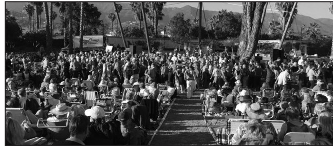
The City's free concert series brings back a variety of sounds to Chase Palm Park Thursday nights this summer

The City Parks and Recreation Department is excited to emerge from the pandemic and announce the return of the Concerts in the Park for the 21st season. The wildly popular summer concert series will kick off on Thursday, July 7 with Santa Barbara's favorite 80's tribute band, The Molly Ringwald Project.