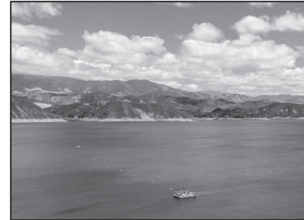
Thanks to community conservation and investment in our diversified water supply, Santa Barbara’s water outlook is good, even if extreme dry conditions persist.

While locally the City has adequate water supplies, statewide the outlook is far more severe. California faces critical drought conditions, and all are being asked to do more to reduce water use and help improve California’s water situation. The Governor has mandated that urban water suppliers move to a higher level of drought response, regardless of local water supply conditions. In response, City Council declared a Stage Two Water Shortage Alert on June 21, 2022.