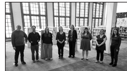
SBPL's professional Librarians continue to be the engine of innovation and creativity for the Library.

During the pandemic, the Library quickly pivoted to provide services virtually and by mail, while prioritizing public service and maintaining health and safety precautions. SBPL has seen a 57% increase in cardholders from February 2019 to February 2022, and continues to add on average, 500 new cardholders a month.