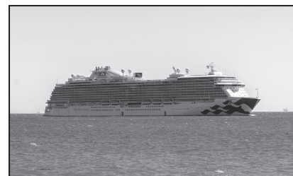
The Majestic Princess at anchor.

After two years of inactivity due to the COVID-19 pandemic, cruise ships are returning to the City. The Waterfront Department established a Cruise Ship Program in 2002 and since that time, the City has hosted nearly 200 cruise ship calls. With COVID cases on the decline and readily accessible vaccines, the department got the go ahead with guidance from the Centers for Disease Control and Prevention (CDC) and the Santa Barbara County Public Health Department.