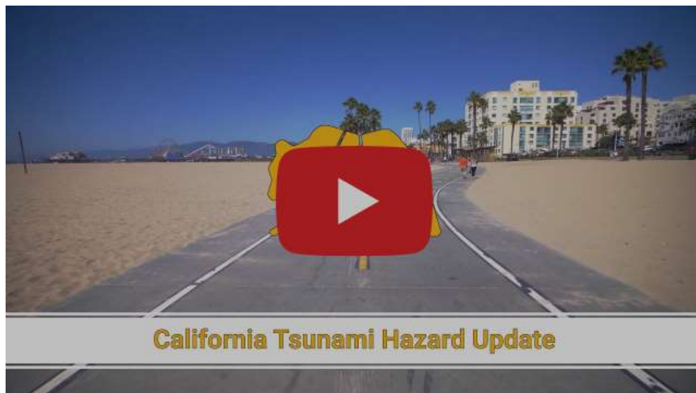
California Tsunami Hazard Update

For more information on tsunamis, check out the California Tsunami Preparedness Guide and the California Hazard Update video below. With a little planning and education we can all be better prepared for tsunamis.