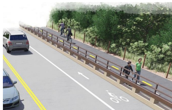
Figure 3: Illustration of barrier rail

After the median islands are installed, Rasmussen will install the guardrails and the handrails on top of the concrete barrier walls. Rasmussen's subcontractor, Marina Landscape, will also be performing landscape work and tree installation starting at Modoc Road and work their way to Las Positas Road and then down to Cliff Drive.