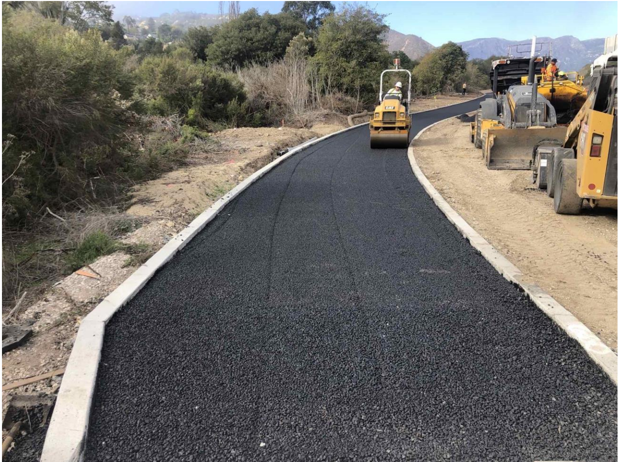
Figure 1: A photo of the roller compactor driving to compact the freshly placed permeable asphalt.

The Las Positas and Modoc Roads Multiuse Path Project (Project) provides a 2.6 mile-long separated pathway for bicyclists, runners, and pedestrians of all ages and abilities along Las Positas and Modoc Roads. This path provides critical local and regional connections. Construction began in late September 2020, with an estimated 18-month construction duration, which also includes the planting of replacement trees and landscaping.